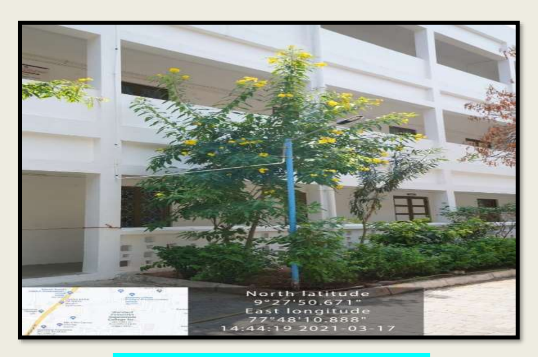
Solar Street Light – Main Block (West)