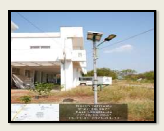
Solar Street Light – Dining Hall (Opposite)